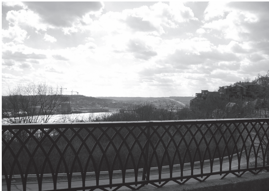
View of the Ohio River and Kentucky from the viaduct

with five memorial plantings of trees. The Presidential Grove began in 1882 and is the largest of the memorials.