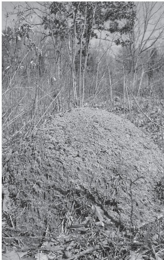
Allegheny ant mound at Adams Lake SNP

The paved trail was created in 1999 with Nature Works funding from the Ohio Department of Natural Resources (ODNR). Look for a playground area shortly after you start, at 0.1 mile. If you like to fish, consider an afternoon relaxing along the lake's edge on one of the many benches overlooking the water.